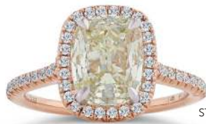
STYLE #: PZLG880

In a world where timeless classics rule but shoppers want a bit more “umph,” Daussi comes through in the most amazing way. With elegant designs and a dramatic center diamond that faces up larger than traditional diamonds, every single Daussi piece is a show-stopper.