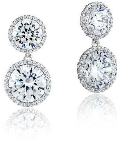
STYLE #: FE67110