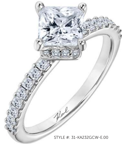
STYLE #: 31-KA232GCW-E.00