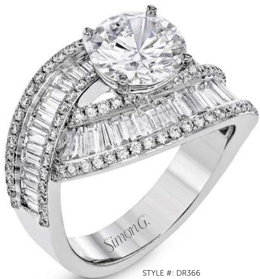
STYLE #: DR366