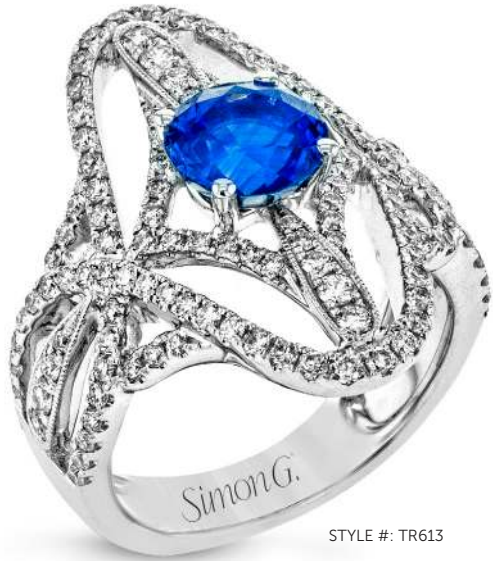
STYLE #: TR613