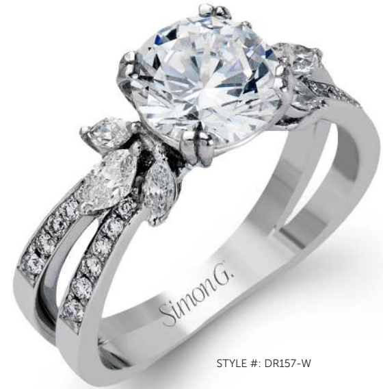
STYLE #: DR157-W