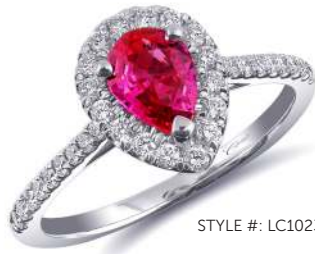
STYLE #: LC10235-PS