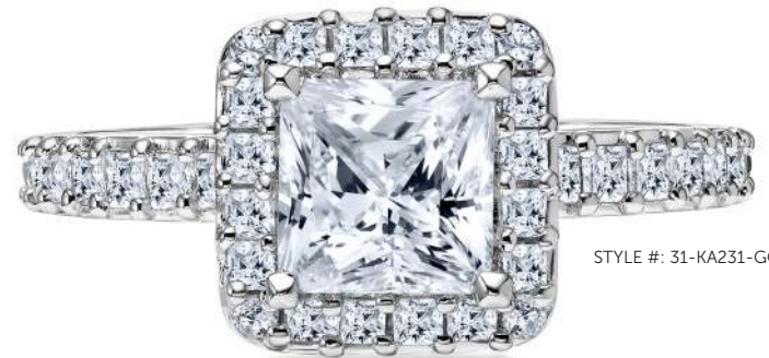
STYLE #: 31-KA231-GCW-E.00