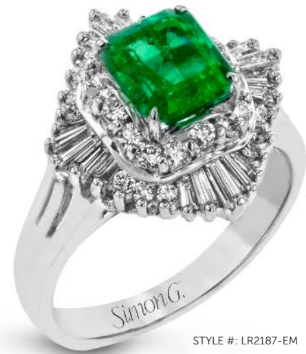
STYLE #: LR2187-EM