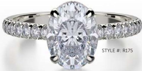
STYLE #: R175

Michael M's modern approach to European sophistication makes the designer truly unique. The old world charm is reflected through European style shanks and architectural designs. The rings are bold and unapologetic, a perfect fit for Robbins Brothers as we strive to offer guests a variety of striking options.