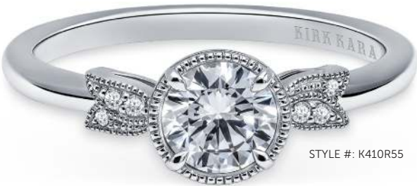
STYLE #: K410R55