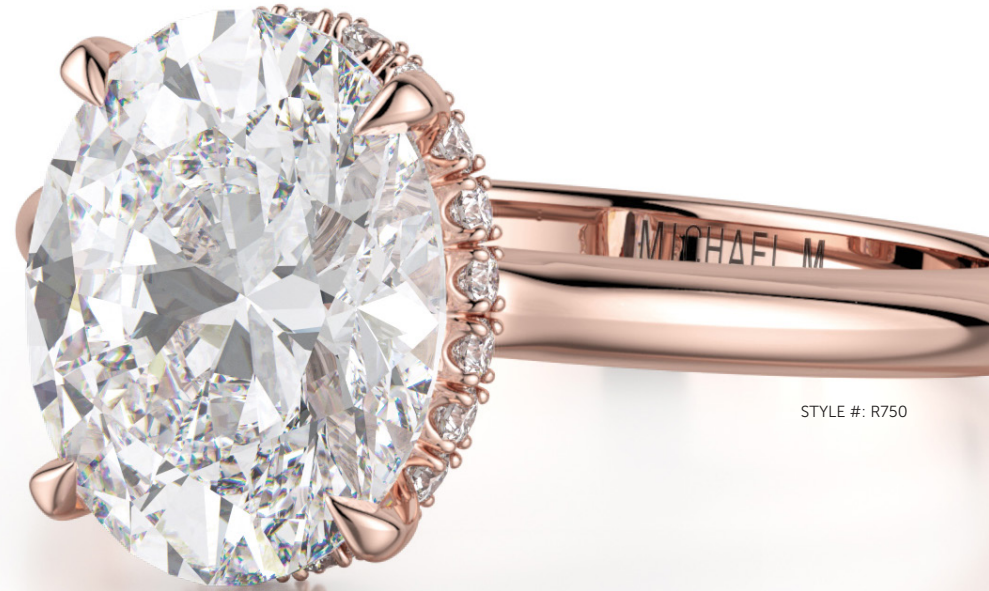
STYLE #: R750