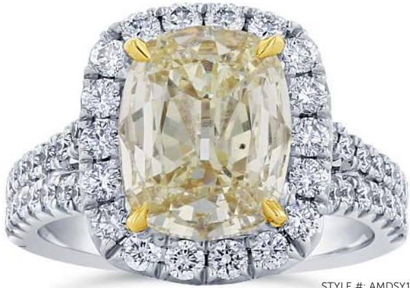
STYLE #: AMDSY102