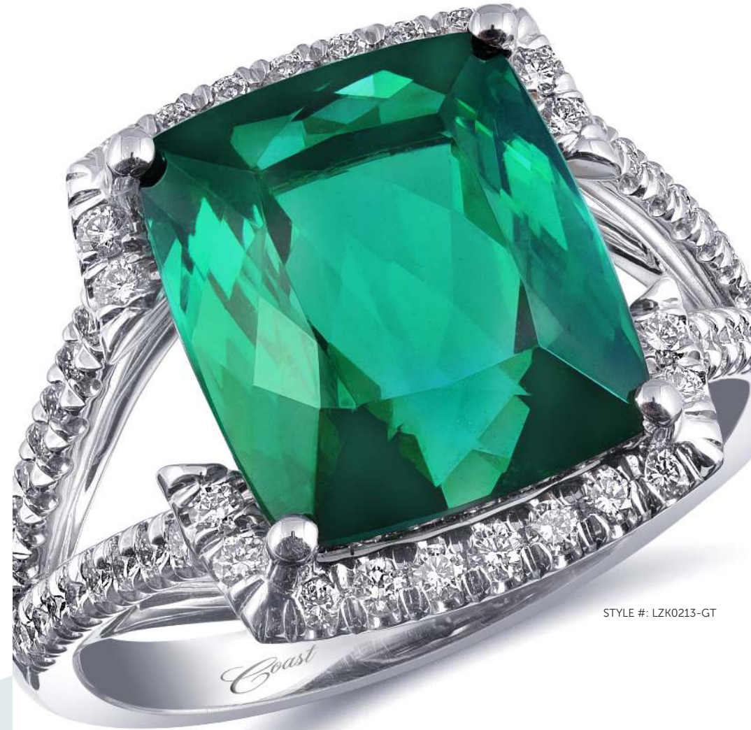
STYLE #: LZK0213-GT