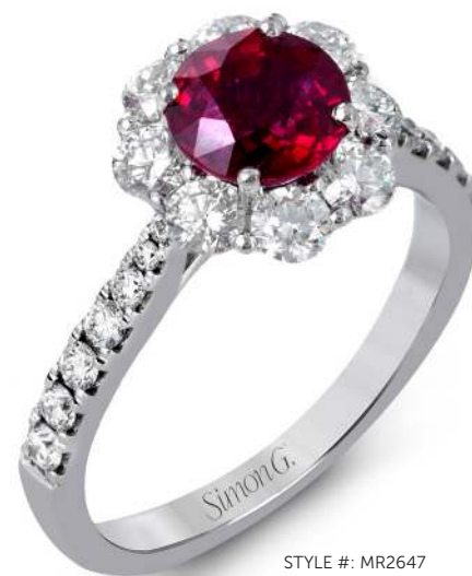
STYLE #: MR2647