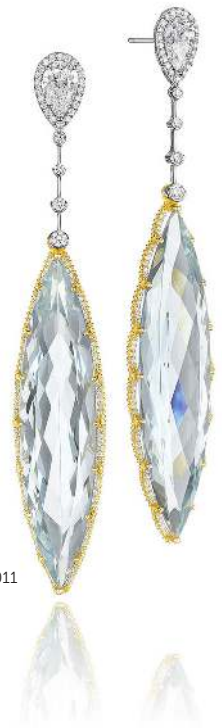
STYLE #: FE011