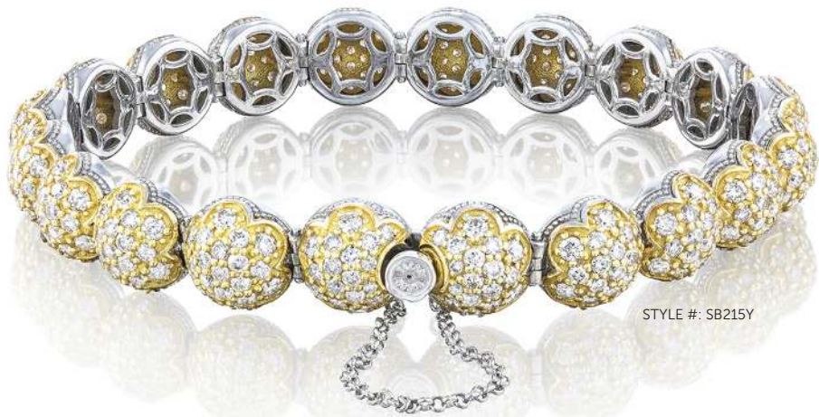
STYLE #: SB215Y