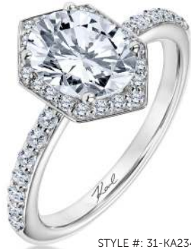
STYLE #: 31-KA234GVW-E.00

This special bridal jewelry collection, exclusive to Robbins Brothers, was founded by fashion luminary Karl Lagerfeld, one of the world's most renowned and visionary designers. The styling of the rings reference special and endearing things to Karl himself, and are inspired by the intricacy and curves of iconic Parisian architecture.