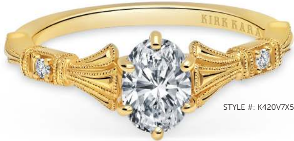
STYLE #: K420V7X5Y