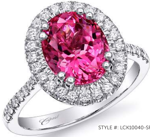
STYLE #: LCK10040-SPIN