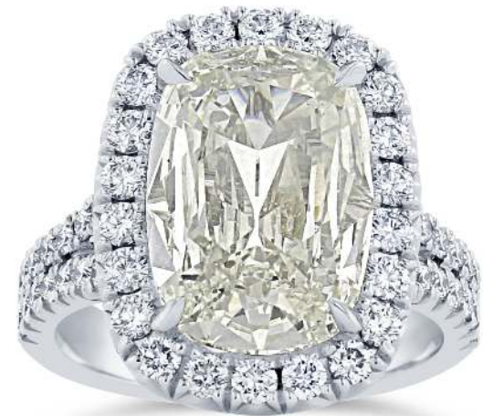
STYLE #: AMDS07260A