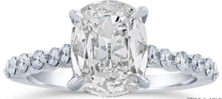
STYLE #: ACL26