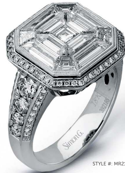
STYLE #: MR2188