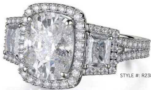
STYLE #: R238