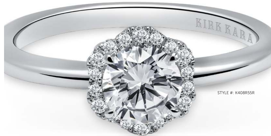
STYLE #: K408R55R