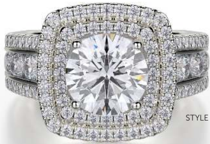
STYLE #: R720