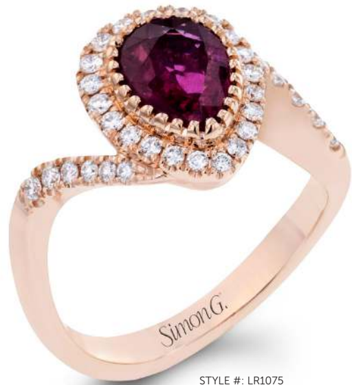
STYLE #: LR1075