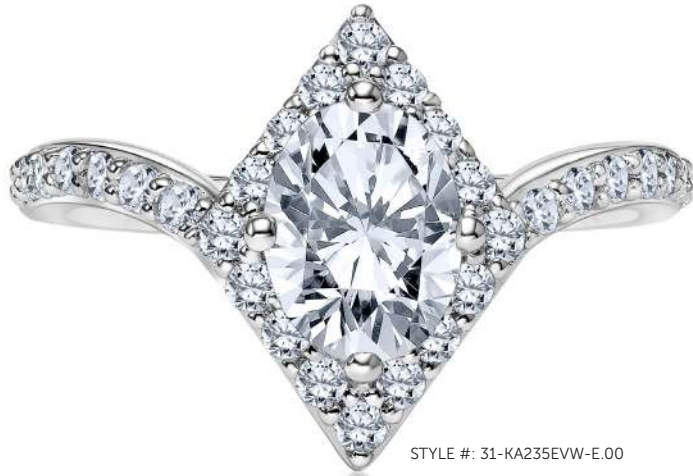
STYLE #: 31-KA235EVW-E.00