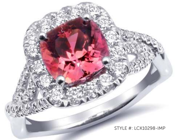
STYLE #: LCK10298-IMP