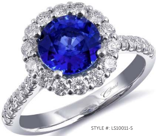
STYLE #: LS10011-S