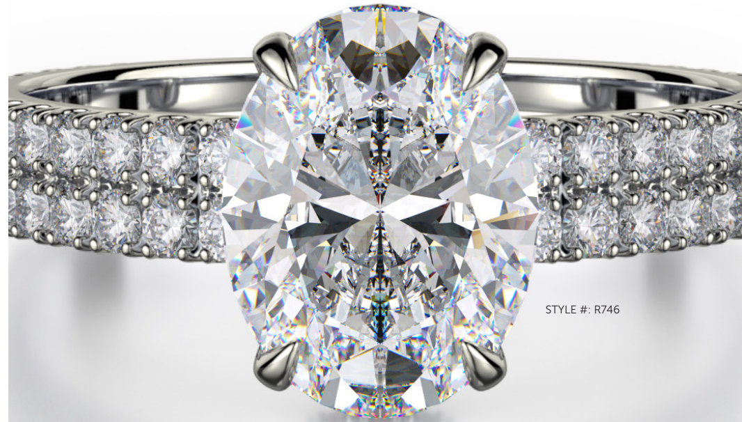
STYLE #: R746