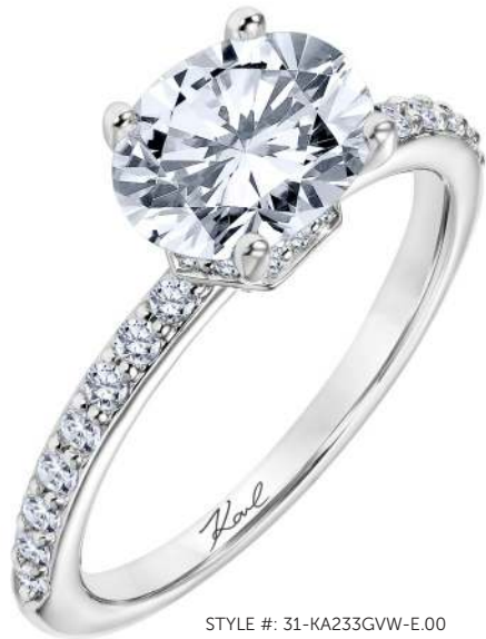
STYLE #: 31-KA233GVW-E.00